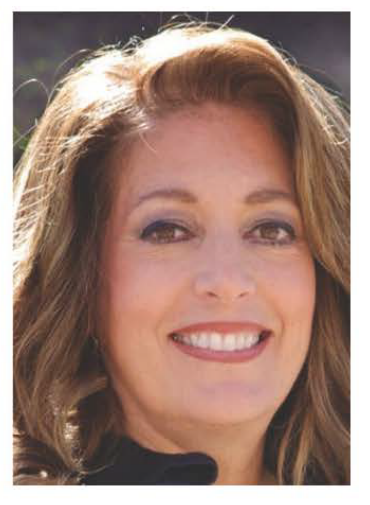
Proposed law would make it easier for Native Americans to argue their side in child custody cases

By SANDRA EMERSON | semerson@scng.com | PUBLISHED: April 9, 2019 at 3:35 pm | UPDATED: April 9, 2019 at 3:36 pm